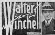
Notes of a Not-So-Innocent Bystander